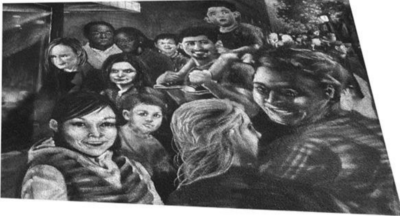
Longmont Mural—courtesy of City of Longmont, CO and Gamma Acosta (artist)